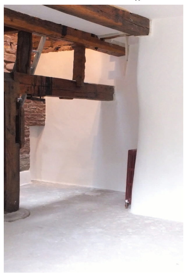
Above, A solid robust floor is achieved with Diathonite Cork Lime Screed Below, Diasen Thermactive Insulation applied to the walls

One group of insulation products, which are moisture vapour diffusion open and have a reasonable degree of water capillarity, whilst at the same time have excellent thermal insulation values are cork lime insulating plasters. Diathonite Thermactive is a thermal insulating plaster which is comprised of natural hydraulic lime (NHL-5), cork, lightweight silica and volcanic ash. The